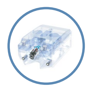
Subsea Digital Stills