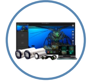
Subsea 4K & HD Video Survey