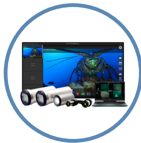
Subsea 4K & HD Video Survey